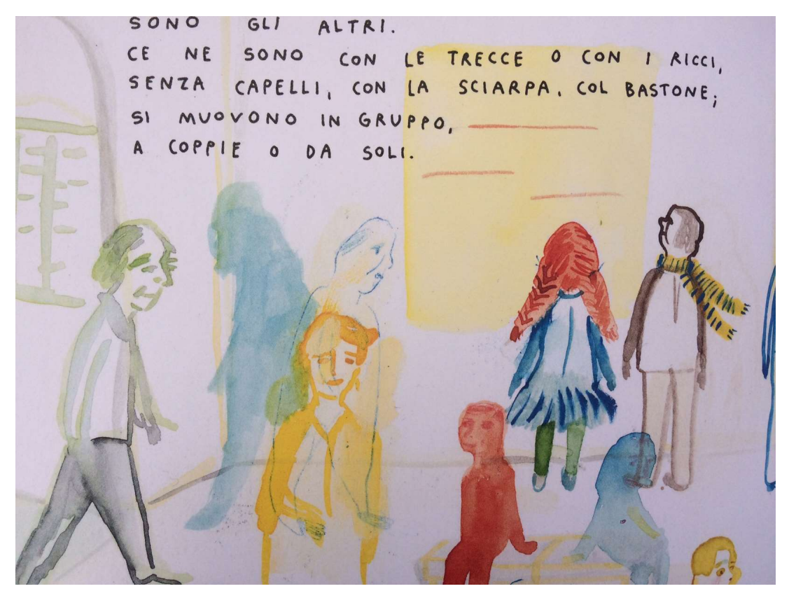
Figura 3. Image of the streets, by: Gli altri , cit. p. 4.

exile, seeking a better place to live, self-recognition, difficult moves, trials, transfer, rejection, return. It is a story that teenagers can understand as a characteristic of the human condition, which make sense through the narrative and figurative re-elaboration that the book proposes.