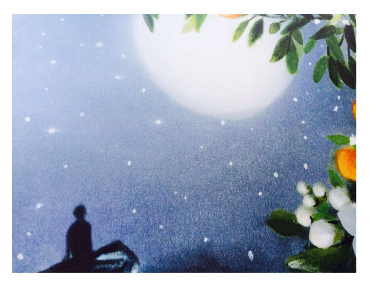
Figure 5. Youssef dived into the sea, by: Il sogno di Youssef, cit. p. 23.

The first album we present use almost exclusively big images to tell the story, a sad and engaging one with very short textes: I. Straw, S. Possentini, Il sogno di Youssef (Camelozampa, Padova, 2016). It is a story (simultaneously real and imaginary) of migration of a child who does not have the desired result. The book is very particular because it is inspired by images widespread a few months ago by televisions all over the world and the newspapers they talked about (and unfortunately tell) the drama of the little children of the boats that do not make it overcome the crossing and die of cold, of starvation, hunger. With illustrations suitable for the age of little readers, it is proposed, for example, the image of a baby lying on a beach, just apparently asleep. The book begins and tells with pictures of a child experiencing loneliness, nostalgia, distance, broken friendships, wounds caused by migrations (Figure 5). The images of the book involve the minds of the children, the feelings, the emotions, the deep values of each one.