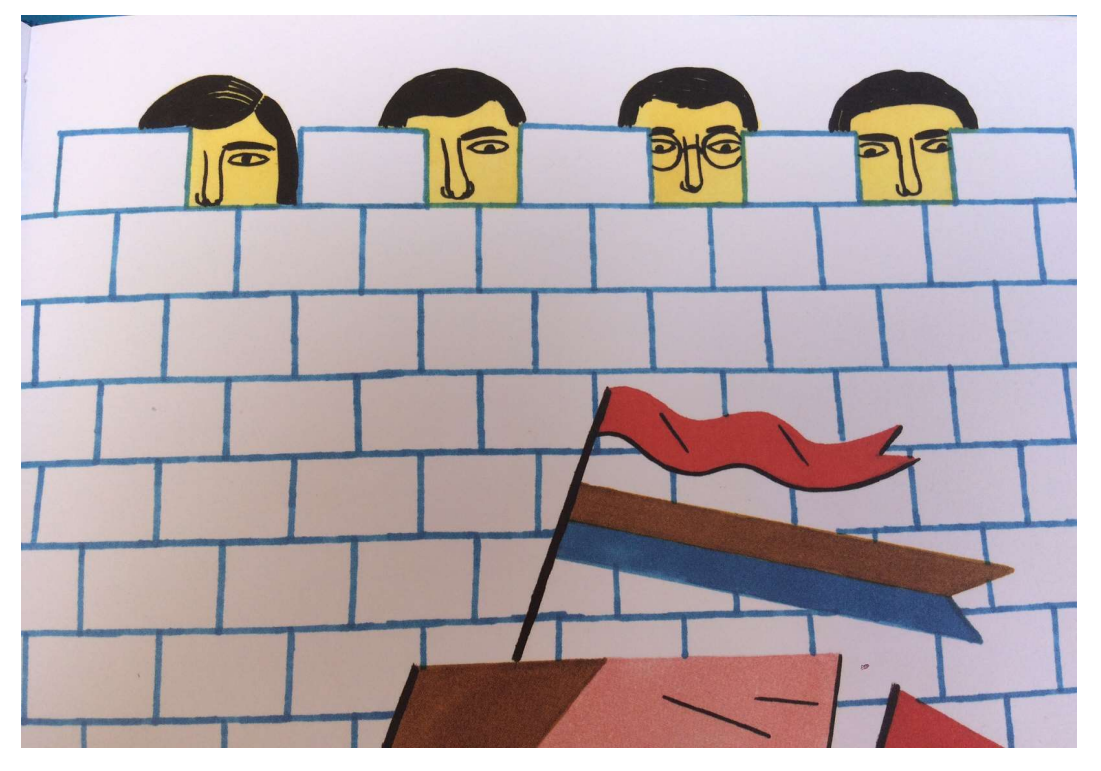
Figure 2. Old or new walls, by: Planète Migrants, cit. p. 39.

Impressive in style and colors, showing humanity made of men and women, boys and old persons ready to risk life on lucky boats and live in refugee camps for weeks and months to escape the war or hunger or famine. We adults get realistic and quantitative information from newspapers and television news about the thousands of humans who, after grueling trips, are stopped at the borders, but for the kids the data provided by the newspapers are far away. This illustrated book instead provides a strong picture of the current migration situation in the world that teenagers can understand. In particular, we found references to frequent attitudes of non-acceptance or rejection of migrants (Figure 2).