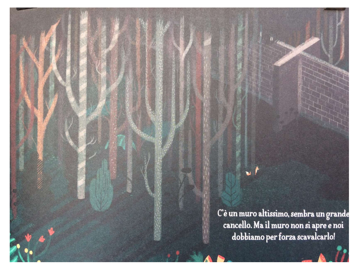
Figure 6. The wall, from: Il Viaggio , cit. p. 21.

the beach. But now we do not go anymore because last year our life has changed forever. The war started" (Sanna, p. 2). From here begins the dramatic adventure of escaping a mother with two children with the goal of reaching a country full of mountains up to that point only known on the pages of the books. The long path (at the beginning it is a journey, then it becomes a getaway) it poses risks and dangers of all kinds. At some point, the desperate journey must stop because the lady and the two children are facing a high wall (Figure 6), a border that is impossible to overcome.