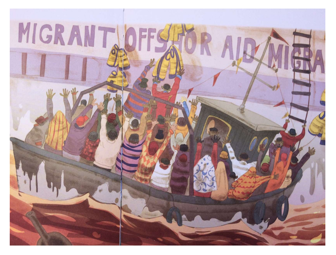
Figure 7. Rescue of refugees, by: L'immigrazione spiegata ai bambini, cit. p. 44.