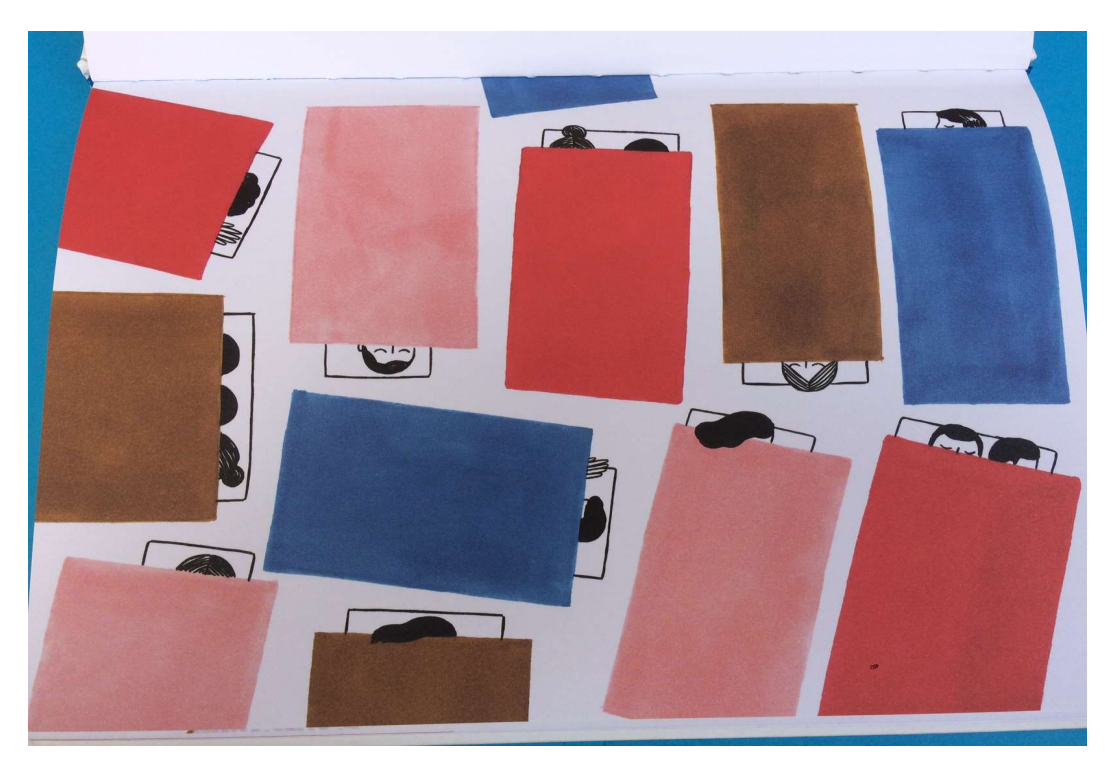
Figure 1. Migrants sleeping in a refugee camp, by: PlanètMigrants, cit. p. 15.

The first is an illustrated book to be used in interdisciplinary teaching activities between the French teacher and the Italian teacher who addresses many issues of current societies linked to migration of refugees and asylum seekers: S. Lamoureux, A. Fontaine, Planète Migrants (Actes Sud Junior, Arles, 2016). The written text section is very accurate and documents many aspects of the current situation of millions of refugees in so many parts of the world. The text is very wide but the illustrations have a strong hold on young readers (Figure 1). They are minimalistic designs.