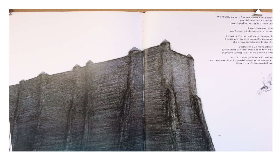
Figure 8. The construction of the wall, from: L'isola, cit. pp. 28–29.

instruments that go in this direction. They promote mutual language learning as they facilitate listening, speaking, sharing, reading, talking between teachers and members of the learning group. The picturebooks as well as some wordlessbooks (as an example: S. Tan, L'approdo , Elliot, Roma, 2008, originally published by Lothian Children Books, Australia, 2006) put teacher and students in front of a wide variety of models and life projects, relationship modes , migrations and travels. They are great tools to create in the classroom, at school, good contexts of comparison that will fit into respect for the origins, languages, habits, family traditions, religions, and spiritual worlds of all people.