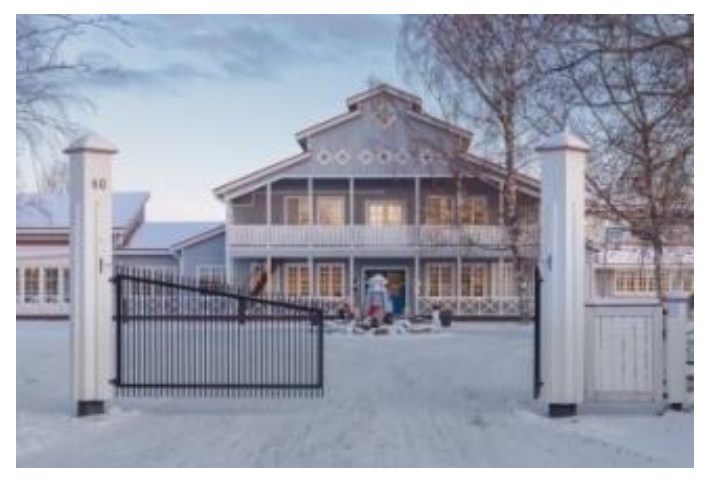
YMV debate in Rovaniemi, Lapland

The Finnish network was happy to welcome 20 young participants from Mediterranean and Baltic sea to Finland to develop their communication strategies in a Young Mediterranean Voices communications lab. This was the second Young Mediterranean Voices event in Finland, after a successful YMV debate in Rovaniemi, Lapland earlier in the fall of 2019.