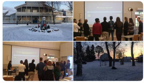
You and 2 others YMV in Kokkola

Young Mediterranean Voices @YoungMedVoices · Dec 2, 2019 VOICES #YoungMedVoices2030 from Libya, Finland, Morocco, Denmark, Algeria, Estonia and Tunisia have travelled all the way to Kokkola, Finland 🕂 🦈 to participate in a Communications Lab aimed at unleashing creative talent to create compelling campaigns to challenge extremist narratives