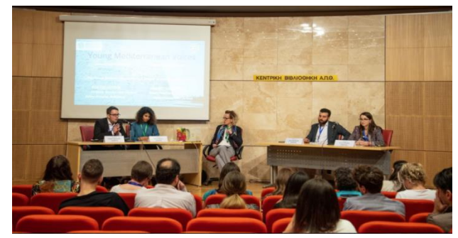
YMV Debate in Thessaloniki

During the General Assembly in Thessaloniki from 23-27 October 2019, an Oxford-style debate took place on 25 October in the afternoon. Two debaters from the North and two from the South agreed on the Motion and had a successful exchange with live audience participation.