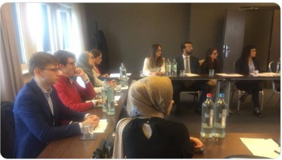
Young Med Voices at the EYL-MENA seminar in Brussels – ALF Twitter account

Young Mediterranean Voices @YoungMedVoices · Nov 4, 2019 The future is here! @YoungMedVoices from Lebanon, Palestine, Spain, Check Republic, Egypt, Libya, Germany and Morocco are getting ready to discuss today global subjects including #SDGs implementation with influential representatives and #EYL40 delegates #YoungMedVoices2030