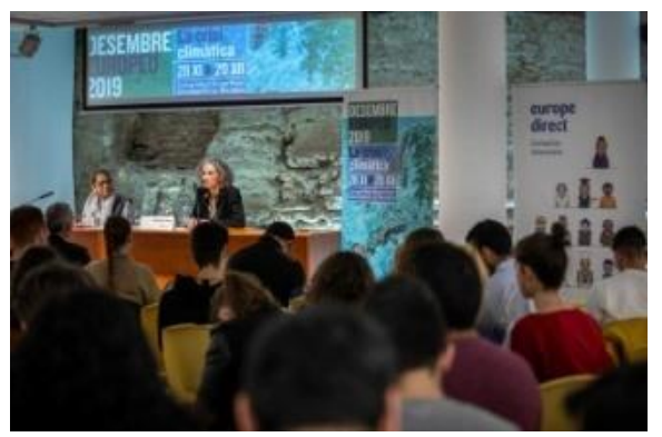
Session on Climate Crisis

The debate brought together a hundred people, including three young students and heads of civil society associations. ReFAL financially supported the travel of three young people from the Network of AIPC entities Pandora (Madrid), Center Euro Àrab (Barcelona), Association AjInter (Jerez de la Frontera) through the notice given to all members.