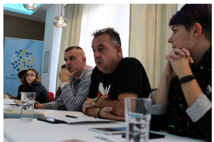
Meeting of ALF BiH Network in Tuzla

Tenth Meeting of ALF BiH Network in Tuzla from 11 to 13 October 2019