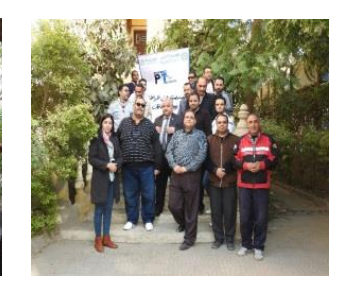
Intercultural Citizenship training

The Egyptian Network of the Anna Lindh Euro-Mediterranean Foundation organized Series of Workshops about Intercultural Citizenship the first one was in upper Egypt on 28 December 2019 in Minia governorate for members of Egyptian network from upper Egypt. The second workshop was in Alexandria on 18 January 2020 and it will organize third workshop on intercultural citizenship next month in Cairo.