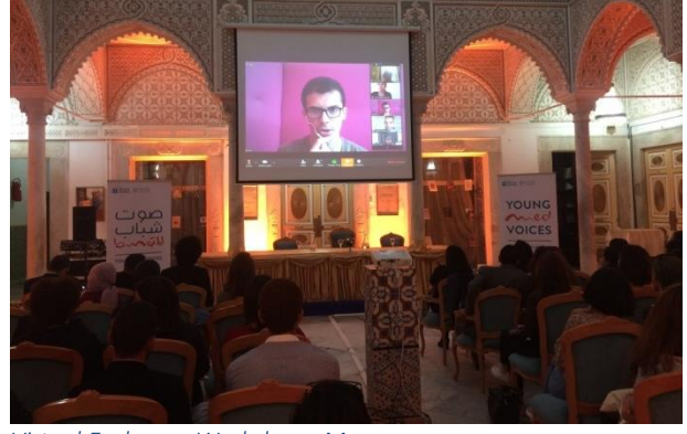
Virtual Exchange Workshop - Morocco

The Debate Exchange activity was featured at the Young Mediterranean Voices Debate & Policy Forums that took place in October and November 2019 in the Southern Mediterranean region. Participants in 4 Forums (Morocco,