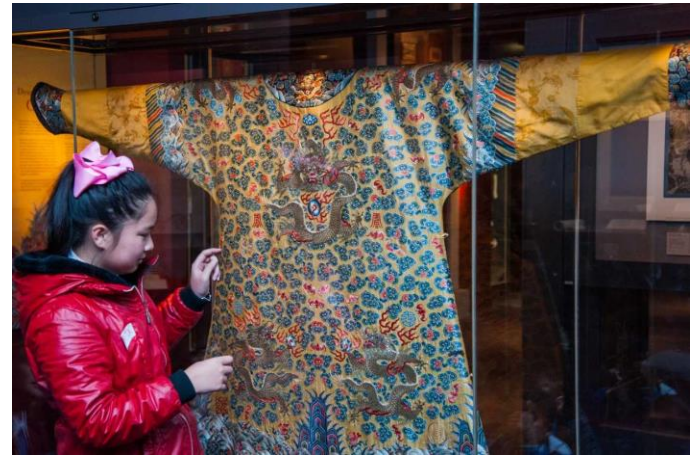
Intercultural Museum programme for schools

reland's co-Head of Network, the Chester Beatty, has worked on a project with two other ALF Ireland members, Mary Immaculate College, Limerick and Maynooth University, County Kildare, initiated an 18 month project to research, develop and build its first Intercultural Museum programme for schools (2018-2020). Their aim was to explore ways to engage primary, post-primary schools and teachers with the Library's unique collections.