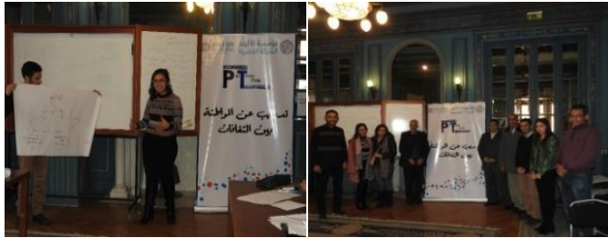
Workshop on Intercultural Citizenship at the Anna Lindh House

The Egyptian Network of the Anna Lindh Euro-Mediterranean Foundation organized Series of Workshops about Intercultural Citizenship the first one was in upper Egypt on 28 December 2019 in Minia governorate for members of Egyptian network from upper Egypt. The second workshop was in Alexandria on 18 January 2020 and it will organize third workshop on intercultural citizenship next month in Cairo.