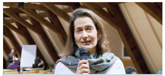
Luxembourg Intercultural Forum – December 2019

On 14<sup>th</sup>December 2019, the Anna Lindh Foundation Network of Luxembourg and the Greater Region organised an intercultural forum featuring the following topic: «The potential of transnational civil society cooperation in support of freedom of speech».