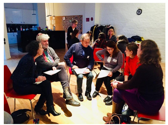
Information Tour to Berlin, November 2019

The Information Tour to Berlin, 17thto 21thNovember 2019, for members of the ALF from France, Germany, Israel, Jordan, Palestine and Poland aimed at fostering exchange among the members and connecting them to civil society actors as well as to state actors and private foundations in Germany. Diverse encounters and interactions on the subjects "Cross-border Cooperation in Civil Society" and "Digital Civil Society" did not only promote knowledge and mutual understanding – the tour also enabled networking to take place and to develop long-term cross-border cooperation.