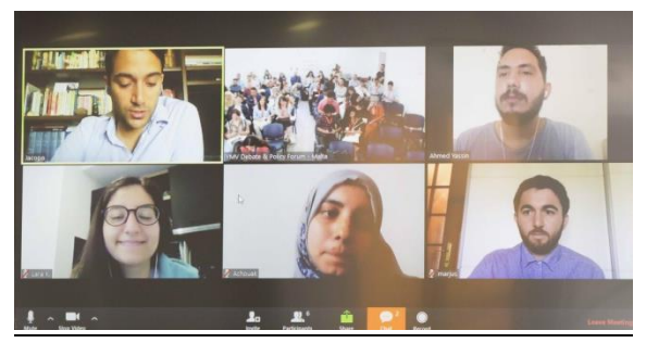
Debate Exchange activities

The Debate Exchange activity led by the Anna Lindh Foundation in the frame of the European Commission's pilot project "Erasmus+ Virtual Exchange" continued its activities on a weekly basis during the last quarter of 2019. ALF offers debate team leaders Training and Exchanges to participants from the eligible countries of the project.