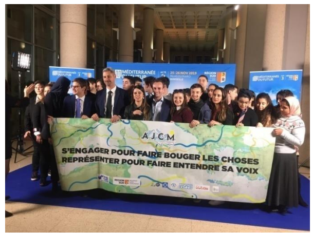
Mediterranean Forum of the Future, in Marseille, November 2019

The AJCM offers a space for dialogue and citizen consultation to the youth around the themes of environment, ecodevelopment and Mediterranean identity. Within this framework, more than 2.500 young people get involved and act each year, around simultaneous actions, carrying values of solidarity and exchange.