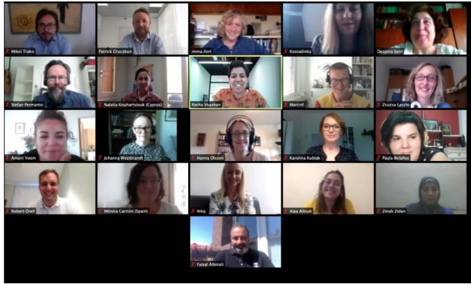
Interactive online training for civil society

Online training opportunity for intercultural dialogue activists