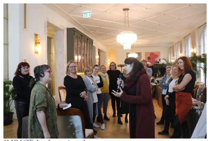
IMPACT Academy at work

However, immediately after the outbreak of COVID-19 local epidemic, closely followed by an earthquake in the Zagreb area (that also largely affected the daily operating of the social life and infrastructure), the National Foundation acted towards the Network members, the majority of which are the beneficiaries of National Foundation's Grant-schemes. The HoN provided the assistance, financial means and even collected their comments and experiences during that difficult time. This aid was considered as a valuable asset that was not relying on ALF financing, nor it was foreseen in any of the strategic documents, but gave the members a notion of belonging and solidarity that is always very important in such situations.