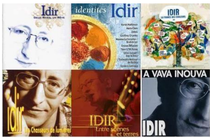
Moualagats in tribute to IDIR

TRIBUTE TO IDIR: AN ARTIST BUT ALSO AN ACTOR IN EDUCATION FOR INTERCULTURAL CITIZENSHIP