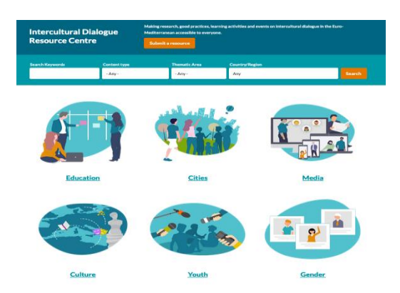
Intercultural Dialogue Resource Centre

Resources uploaded in the Centre include Publications, Learning Activities, Audiovisual, Events, Resource People and Good Practices and are divided according to the following themes: Education, Media, Culture, Cities, Youth and Media.