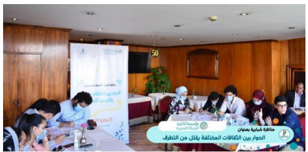
Youth Debate in Alexandria

The Head of the Egyptian network organized in July 2020 a youth debate entitled "Dialogue between different cultures reduces extremism" which was held in Alexandria and attended by youth from civil society institutions in Alexandria and Delta, the debate format provided a very good platform for two teams, one of them supporting the motion and the other team opposing the motion. \square