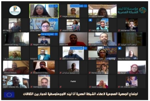
Meeting of the Egyptian Network

The meeting was held online through the zoom conference on 20 June 2020 and was attended by 28 members of Egyptian network where updates of Egyptian network were discussed.