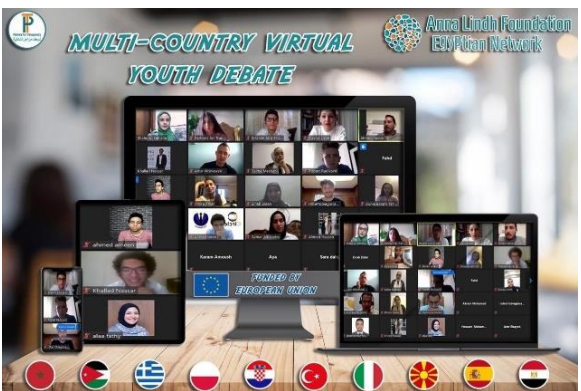
Virtual Youth Debate

VIRTUAL MULTI- COUNTRY YOUTH DEBATE – 18 June 2020