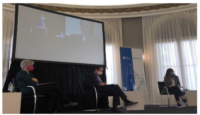
Intercultural Mediterranean Dialogue

On the occasion of the 25th anniversary of the Barcelona Process, the conference "Intercultural Mediterranean Dialogue": Recognizing yourself in the culture of the other" took place on 30 September in Barcelona. Organized by the Government of Catalonia with the support of the European Institute of the Mediterranean (IEMed) and the collaboration of Barcelona City Council.