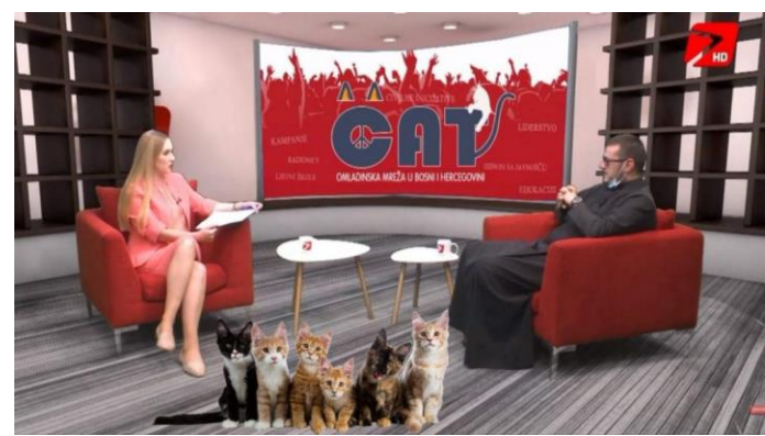
RTV7 Tuzla 1

There is a Committee for Interreligious Cooperation in Tuzla, which was formed on the initiative of the Interreligious Council in Bosnia and Herzegovina. Among numerous activities, they strongly condemn the desecration of religious buildings and monuments, and work together to promote unity, togetherness and peace.