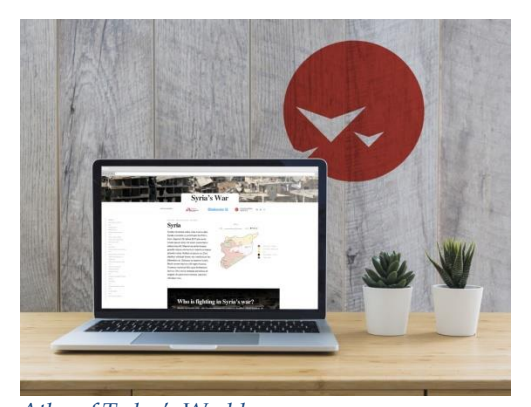
Atlas of Today's World

At a time of information abundance, there is a need for an accessible information tool that offers higher perspective in a way that is understandable for anyone from the broader public.