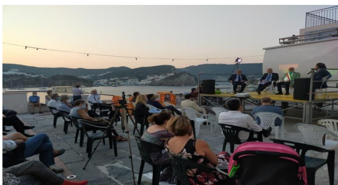
Participants at the Ponza Prima-Med Inter-institutional Conference

In view of the Euro-Med Summit scheduled for November 26, 2020, to celebrate the 25th Anniversary of the Barcelona Declaration, and the restoration of the Santo Stefano Penitentiary in Ventotene, Mediterrean Prospectives (Prospettive Mediterranee) presented — on the occasion of the inter-institutional annual Ponza Prima-Med Conference held in the Ponza Island (RIDE-APS' member), on September 14, 2020, — a proposal to set up at the local Villa delle Tortore a Laboratory for Research and Higher Education on Sustainability devoted to Mediterranean talented women and new generations (ponzaprimamed.com).