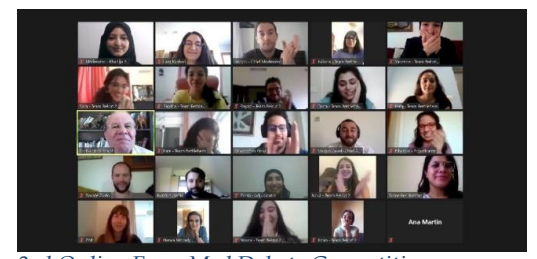
3rd Online Euro-Med Debate Competition

TEAM BEIRUT II WINS THE 3RD ONLINE EURO-MED DEBATE COMPETITION, DEMONSTRATING YOUTH'S POTENTIAL IN ADVOCACY ISSUES – 22, 23, 29 and 30 August 2020