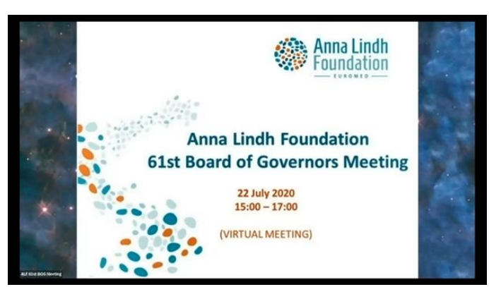
ALF Virtual BoG Meeting – 22 July 2020

ollowing the first virtual Board of Governors meeting held on the 18th of June the Anna Lindh Foundation organized its second virtual meeting on Wednesday 22 July 2020.