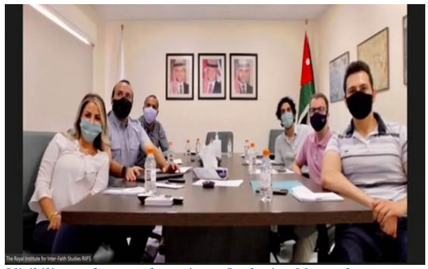
Visibility and outreach session - Jordanian Network

The session was held at RIIFS meeting conference room, in which we used zoom and p2p to connect with the online future members. \Box