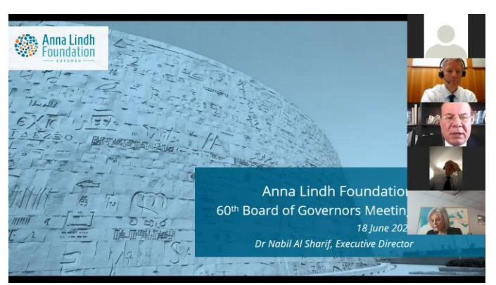
ALF Virtual BoG Meeting – 18 June 2020

The Anna Lindh Foundation organized on the 18<sup>th</sup> of June its first virtual Board of Governors meeting during the current global health crisis of COVID-19 with its impact on humanity at the economic and social levels, imposing new measures and social changes and regulations with physical distances, mobility limitations, and closing border.