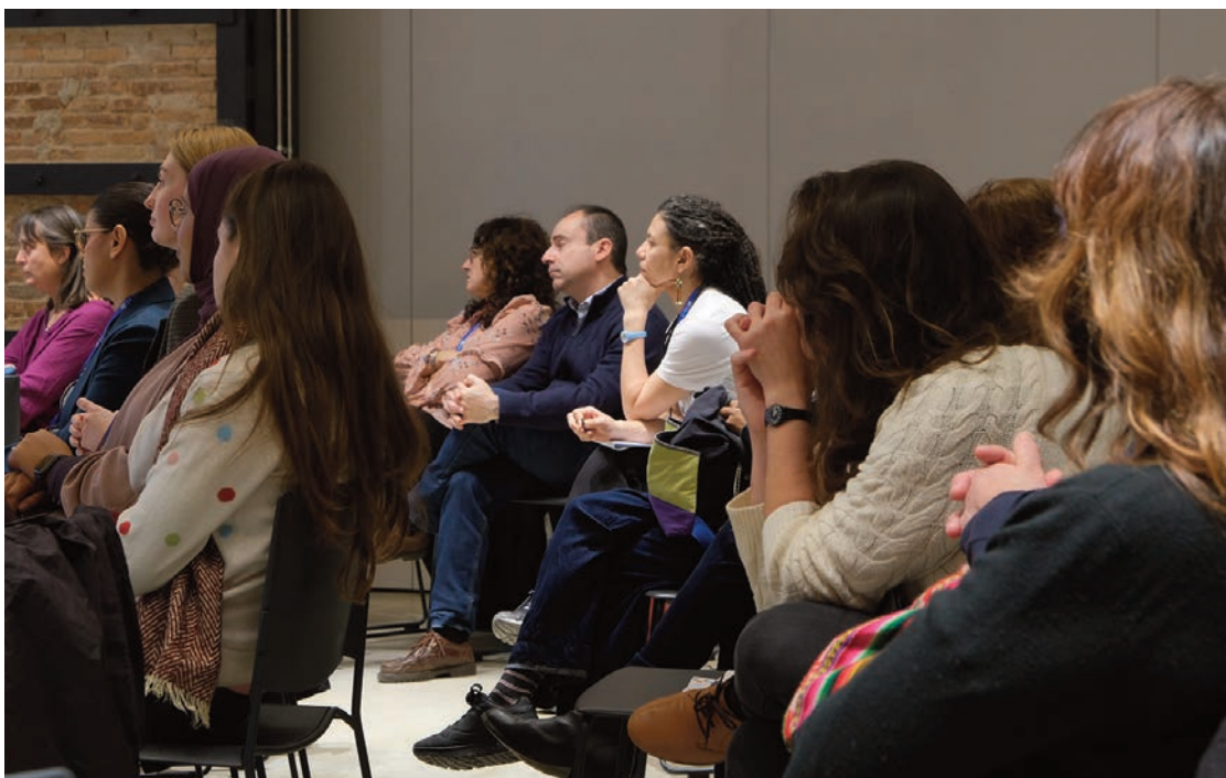
ReFAL members at the Marketplace of Ideas session