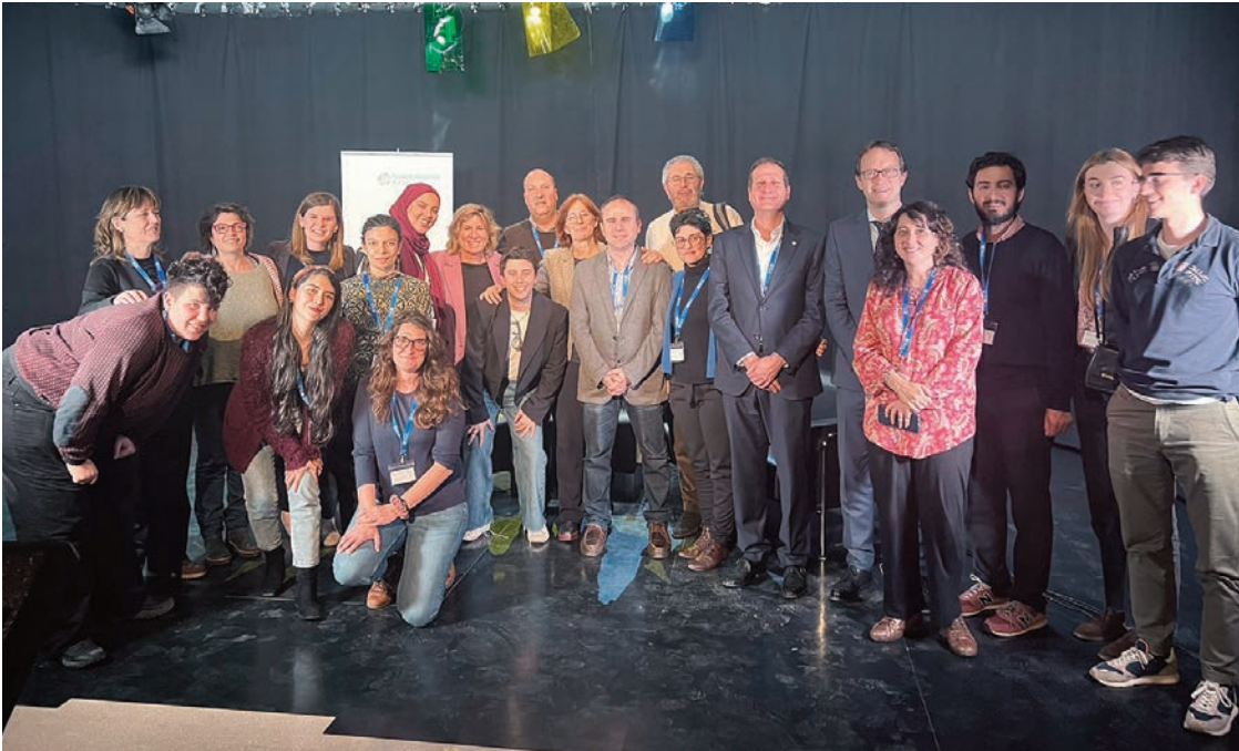
Participants of the Intercultural Marathon held on the set of the Blanquerna Observatory