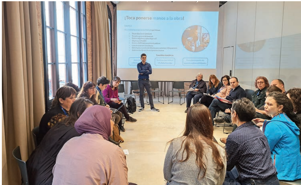
ReFAL participants in the Podcast creation working group "Communicating with Impact"

The creators of the awareness campaign “Voices United. Listen to what unites us,” focused on the theme of “New Narratives vs. Polarization,” which aimed to include the podcast project from the second group, along with other dissemination formats such