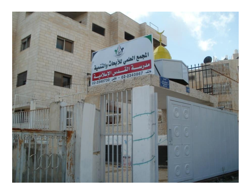
"Linking and pressure to enhance the communal participation."

This includes both levels the local and the international to ensure the effective contribution and enhance the communal participation of the institutions of civil society for the women, the children and the young and the marginalized social groups, this kind of link and pressure also includes supporting the rights of man through numerous linking patterns.