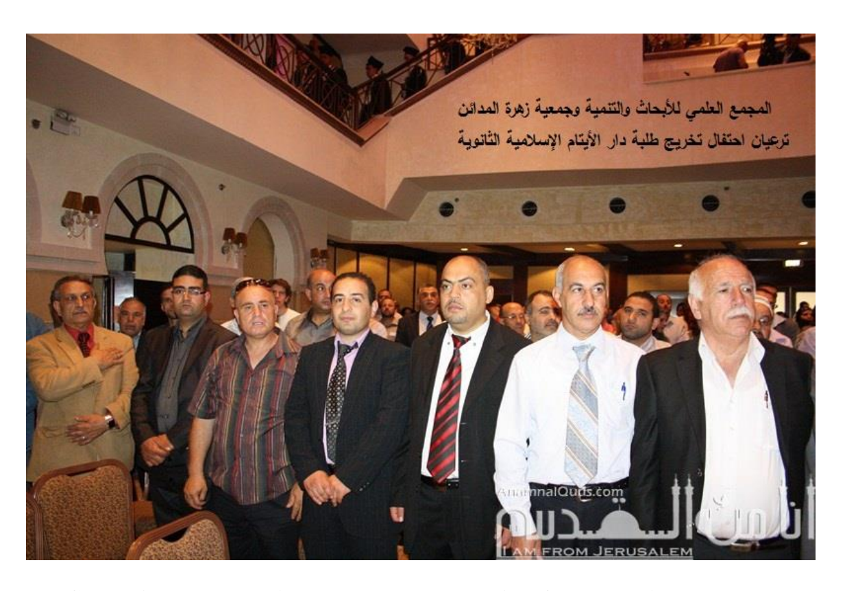
The Consortium branches (Headquarters, the old city of Jerusalem)

The Scientific Consortium for researches & development inaugurated its central headquarters in the old city of Jerusalem directed by the conviction and faith for this necessity of contribution to gratifying the developmental needs of the city residents especially that Jerusalem is an inseparable part of the Palestinian land occupied in 1967.