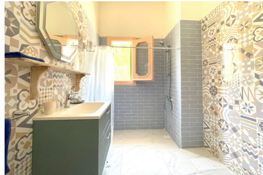
Left: En-suite bathroom to bedroom 1.