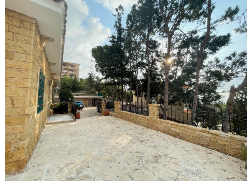
Top Right: Entrance to ground floor terrace.