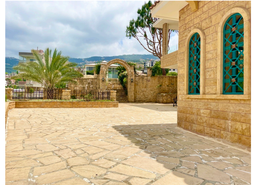
Bottom Right: Ground floor terrace – access from multifunctional space (shown in slide 6).