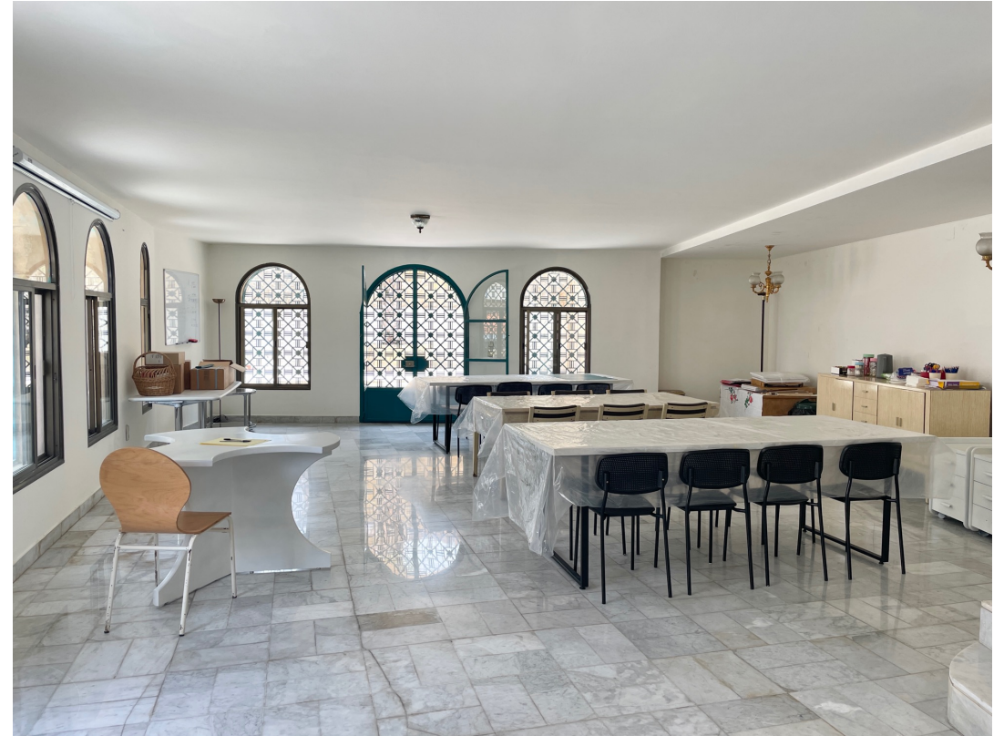
Above: Multifunctional hall with adjoining dirty kitchen (for art workshops), bathroom, and access level terrace. Entrance either form inside the house or separate from the outside