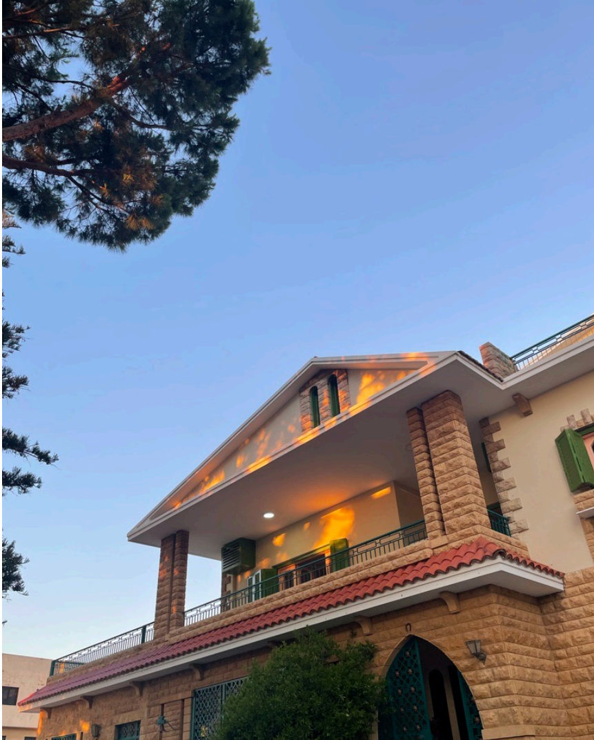
Left: View of entrance façade and first floor balcony.