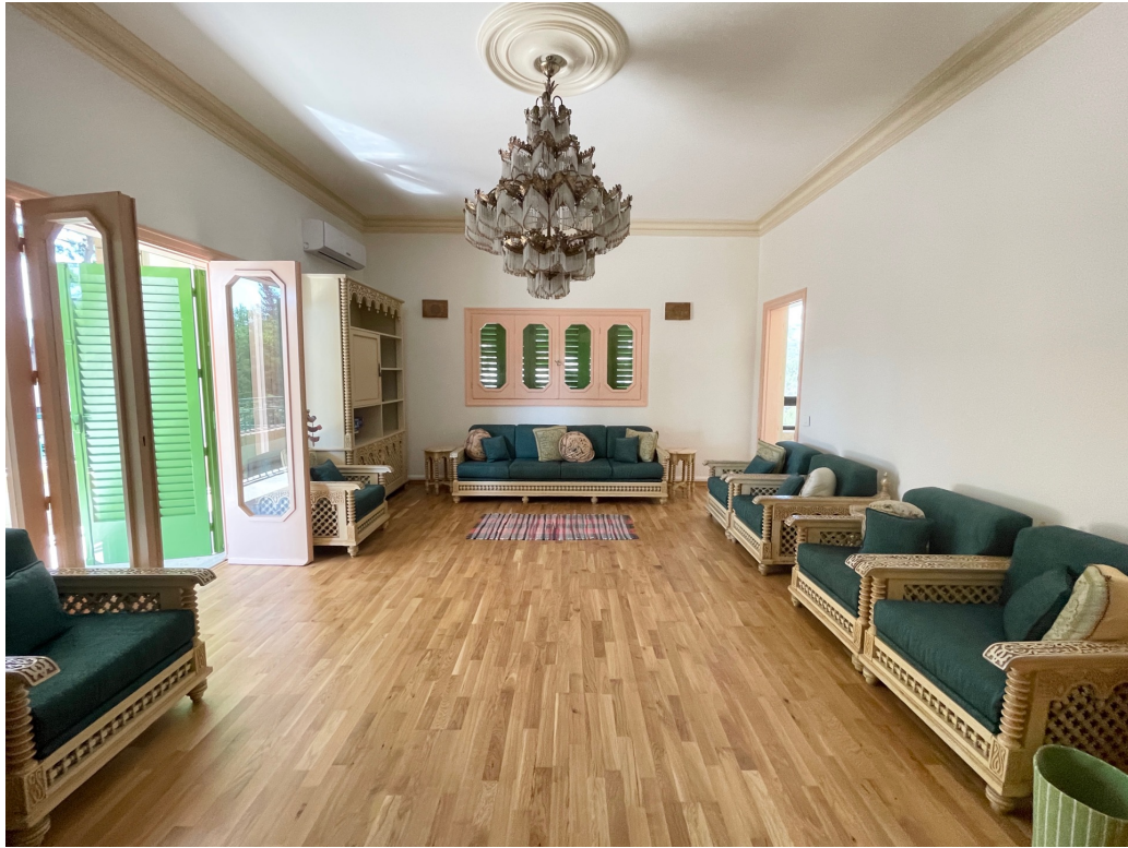
Common living room with fireplace. Possibility of adding 2 folding beds, with an extra folding bed in the adjoining library room.