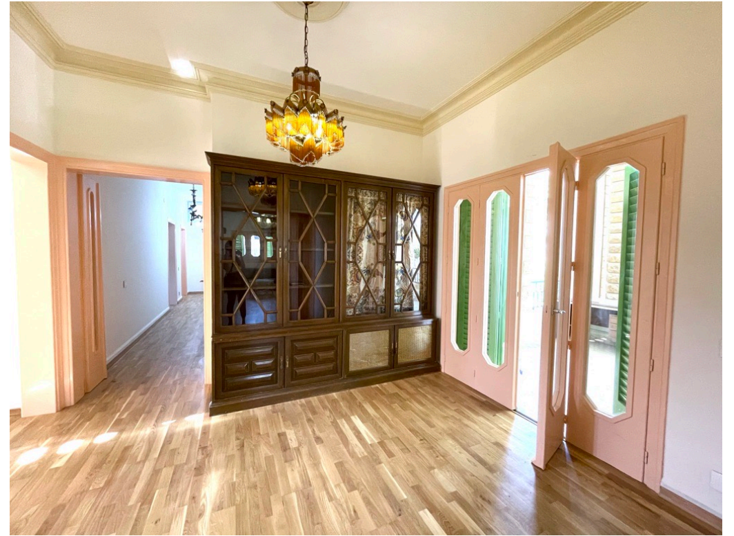
First floor landing, between bedrooms and living room, leading to first floor balcony