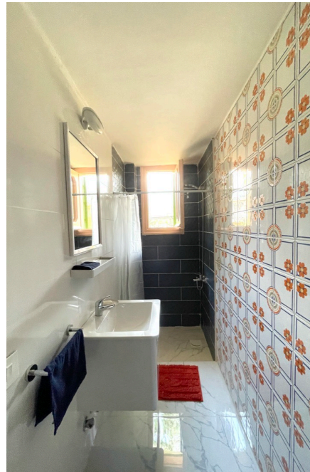
Right: En-suite bathroom to bedroom 3.

Possibility to add extra single bed to sleep 3.