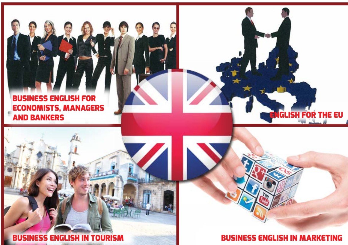
BUSINESS ENGLISH FOR ECONOMISTS, MANAGERS AND BANKERS